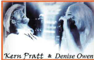
Performing 1:00 p.m. – 2:30 p.m.